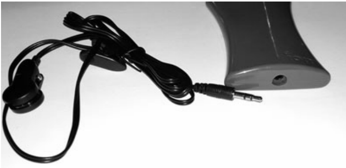
Fig. 3 – Sensor Cable and Connection Port

Insert the cable with the round plug at the end of the ear clip cable into the corresponding round port on the end of the iom BLUE (See Fig. 3)