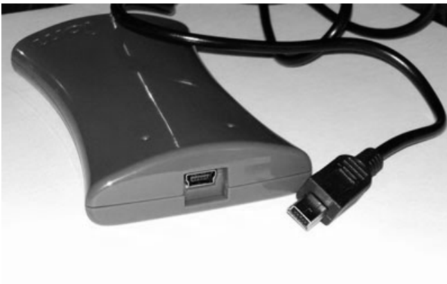
Fig. 1 – Charging Cable

Your iomBLUE is charged by connecting the square tip of the USB cable into the matching port on the iomBLUE hardware. (see Fig. 1)