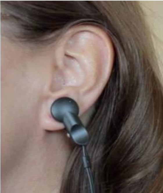
Fig. 4 – Sensor on ear lobe

Please be sure that you remove any hair from the area, as it can interfere with the integrity of the signal. You will see a blinking red light in time with your heart beat on the iomBlue and this should be beating steadily to display a good connection. Adjust accordingly until you see this display reliably. (See Fig. 4)